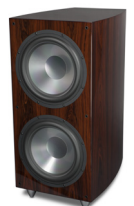
High-gloss South American Rosewood finish with grille off.