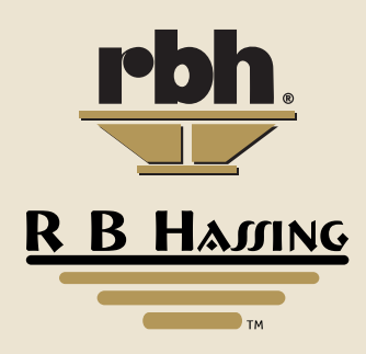
High Performance Home Audio Redefining the Way You Experience Sound™

*Warranted for 5 (five) years from date of purchase to be free from defects and workmanship. For more information see your RBH dealer.