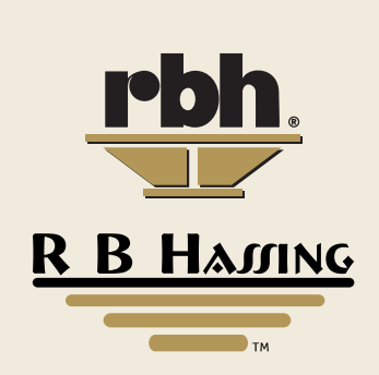
High Performance Home Audio Redefining the Way You Experience Sound™

*Warranted from date of purchase to be free from defects and workmanship. Five (5) years on the cabinet and woofers, and one (1) year on the amplifier For more information see your RBH dealer.