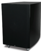
Standard high-gloss black finish with grille on.