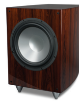
High-gloss South American Rosewood finish with grille off.