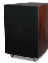
High-gloss South American Rosewood finish with grille on.