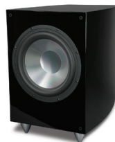
Standard high-gloss black finish with grille off.