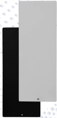
black or white fabric grilles