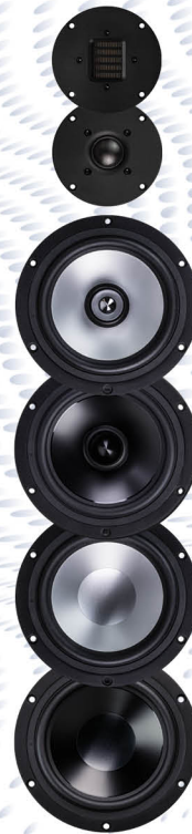
standard or reference drivers available